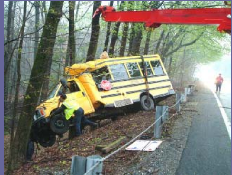
Major Accident: USA