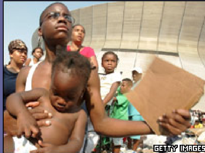
Hurricane: New Orleans