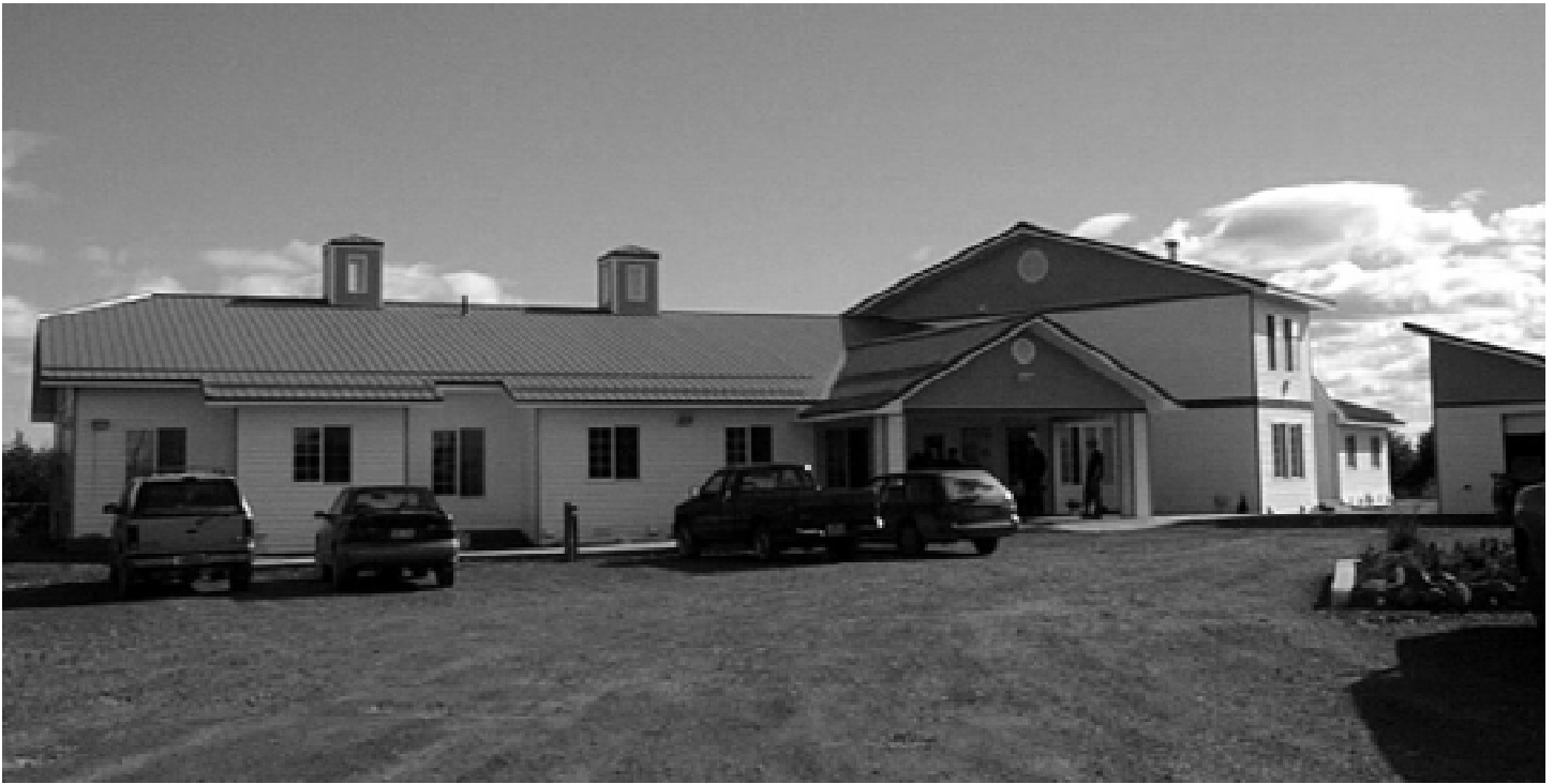
Dillingham's Marrulut Eniit Assisted Living Facility.